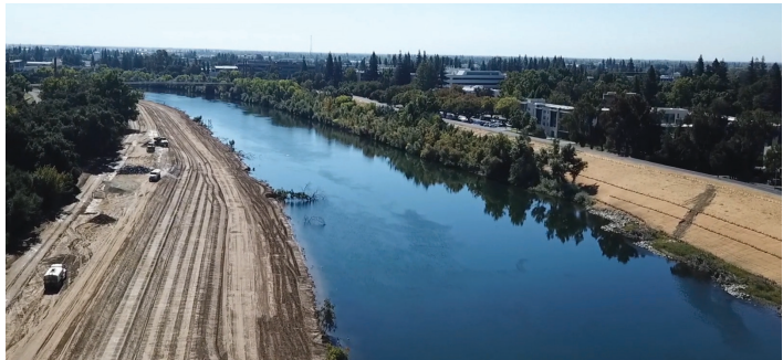
Bank protection work conducted by the US Army Corps of Engineers.

What to do: Keep your property clear and report larger blockages to ARFCD at (916) 929-4006. ⚡