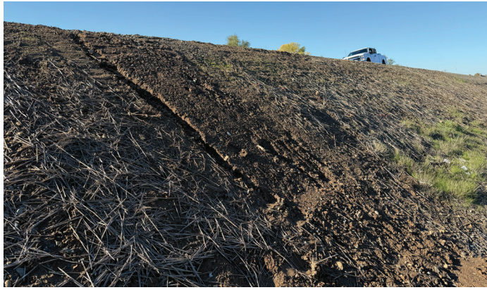
Rainfall erosion on levee.