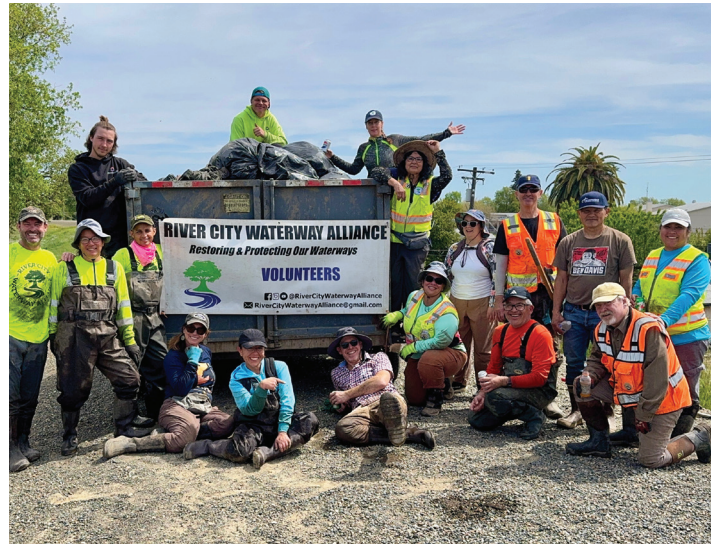
American River Flood Control District crews at work in our community.

Volunteers literally do the dirty work. Provided with tools and a healthy dose of camaraderie, they remove trash that increases flood risks by impeding natural water flow, as well as damaging the ecosystem. The American River Flood Control District provides heavy equipment to help, hauling away the trash and repairing damage to the levees from encampments.