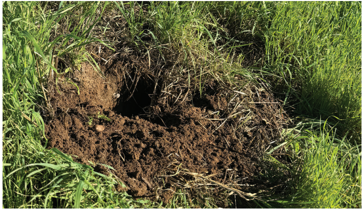
Rodent burrow damage on levee.