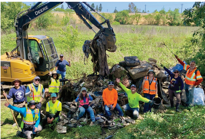
American River Flood Control District staff help RCWA volunteers clean up levee areas and repair damage.

31,000 hours of time has been donated. The result: the removal of 1,620 shopping carts, more than 25,500 needles and over 6,800 pounds of batteries (as well as textiles, tires, carpeting and an occasional Barcalounger).