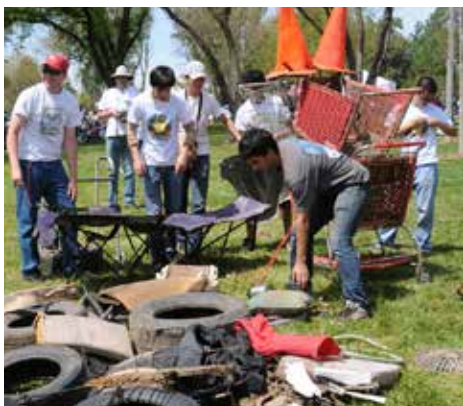
Volunteers gather at the celebration to create sculptures for the "Junk & Gunk Contest"