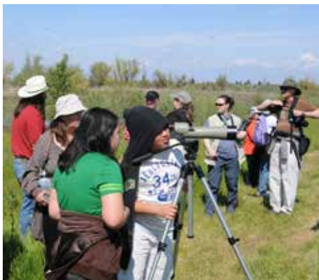
Activities during Creek Week include a "Birds & Bloom Tour" of the Bufferlands