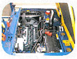
Fully Opening Engine Compartment